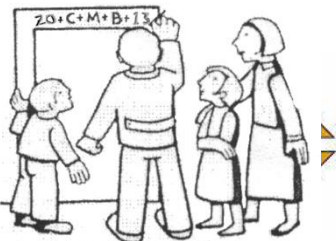
Christ, bless this home CHRISTUS MANSIONEM BENEDICAT